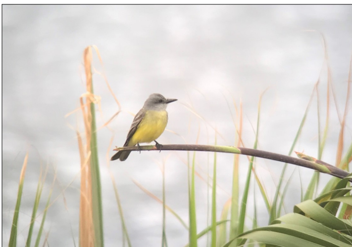
This calling Tropical Kingbird was at San Onofre State Beach on the unexpected date of 19 June 2019.

A booby photographed from a fishing boat about one mile off the mouth of Las Flores Creek at Camp Pendleton on 28 Jun (SM) and another seen from shore in Imperial Beach on 29 Jun (MaS and JTS) were both too distant to tell if they were Masked or Nazca Boobies. Distinguishing immatures of these two species prior to their acquiring adult-like bill coloration is problematic, and to identify those that have acquired adult-like bill coloration, observers must be close enough to determine the color.