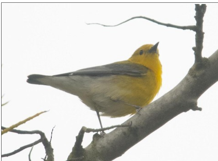
This female Prothonotary Warbler in residential Point Loma was photographed on the second day of its 1-3 June 2019 stay.

Three Summer Tanagers were reported away from the known breeding location at Scissors Crossing on San Felipe Creek: a female at the Roadrunner Club in