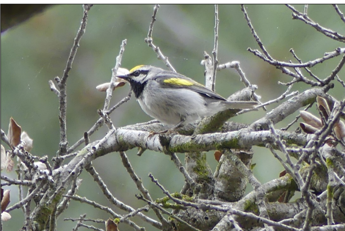
The male Golden-winged Warbler in San Diego's Presidio Park on 4 June 2019 drew a crowd, being the first “chasable” in 35 years.

at Point Loma Nazarene University on Point Loma on 7 Jun (MH), a Prothonotary Warbler remained between Dupont and Warner Streets in residential Point Loma 1-3 Jun (AA, eBird), an American Redstart was found along Tecolote Canyon on 3 Jun (NF) and a singing male Magnolia Warbler was along Pio Pico Street in residential Point Loma on 7 Jun (SES). A singing male Northern Parula was near Doane Pond on Mount Palomar on 15 Jun (JS) and another near the Old Globe Theater in Balboa Park 24-26 Jun (TRS, eBird). A Townsend's Warbler at La Jolla Summit Park in La Jolla on 9 Jun (JD) was an exceptionally late spring migrant.