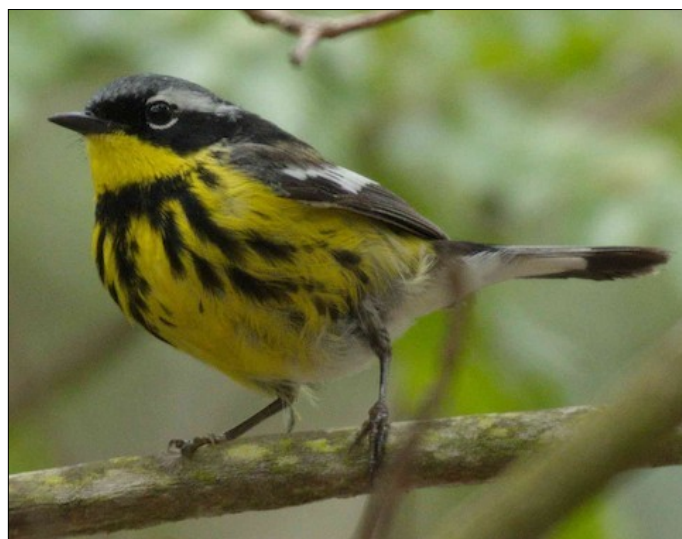
This highly patterned male Magnolia Warbler in residential Point Loma on 7 June 2019 remained for only one day.

Borrego Springs on 1 Jun (KW), a young male at the University of California in La Jolla 6-10 Jun (ED) and a female nearby at La Jolla Summit Park 9-10 Jun (NF, eBird). Three Rose-breasted Grosbeaks were reported, with single males in Escondido on 1 Jun (DHa), in Leucadia on 2 Jun (JMcM) and along Tecolote Canyon on 16 Jun (NF). A Lazuli Bunting