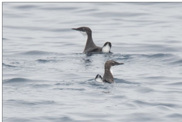
The two Craveri's Murrelets off San Diego on 9 June 2019. The wing feathers on the closer bird were not fully grown, and it was believed to be a juvenile still unable to fly.

A Greater Scaup at Marina View Park on south San Diego Bay on 15 Jun (PEL) may be the first ever reported in June. However, two were on south San Diego Bay on 30 May 1963, and one there 15 Sep 2000 may have been present all summer based on the fact that the earliest fall migrants are not expected before November (Unitt 2004). A Horned Grebe, rare after the end of March, on south San Diego Bay 3-19 Jun (PEL, eBird) was likely attempting to summer locally.