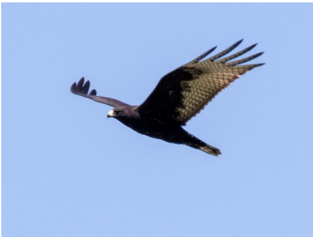
A migrant immature Zone-tailed Hawk circling over Ft. Rosecrans National Cemetery on 10 September 2019.

( eBird ). In addition, single birds were at the San Diego River mouth 4-30 Sep (JPe, eBird ), San Dieguito Lagoon on 16 Sep (MT) and at the Santa Margarita River mouth 14-20 Sep (PAG, eBird ). Reddish Egrets are now found annually along the coast to as far north as Morro Bay in San Luis Obispo County but very rarely farther north. An immature Mississippi Kite was reported over Encinitas on 10 Sep (JMcM), and another was seen over University City on 14 Sep (PC). An immature Zone-tailed Hawk was photographed over Ft.