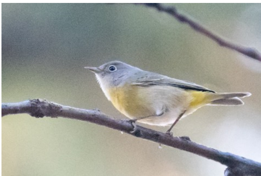
This Virginia's Warbler was an unexpected find amongst migrant wood-warblers at Stonewall Mine in Cuyamaca Rancho State Park on 15 September 2019.

other two were at Ft. Rosecrans National Cemetery on 24 Sep (JA) and at 28 th and Beech Sts. in Balboa Park 28-30 Sep+ (LW, eBird ), the latter believed to be the same bird present there last winter. The only Tennessee Warblers reported were one at Batiquitos Lagoon on 13 Sep (GNe), another at the upper end of Agua Dulce Creek on 14 Sep (AD) and a third at Ft.