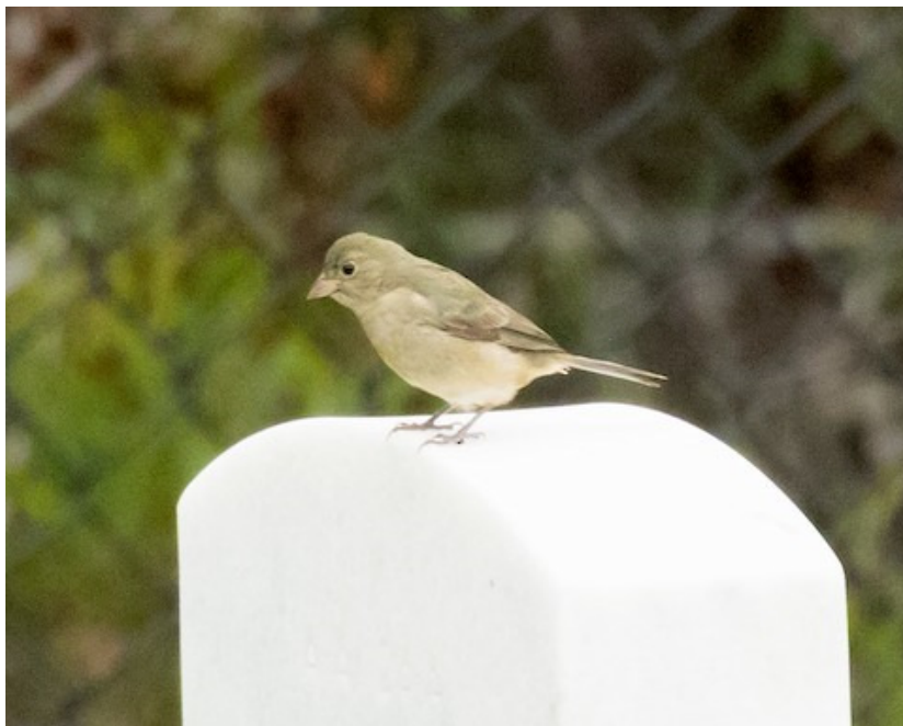
This hatch-year Painted Bunting at Ft. Rosecrans National Cemetery on 1 September 2019 remained only long enough to be photographed before disappearing.

The Summer Tanager found at Villa La Jolla Park on 28 Aug (AA) was still present 4 Sep ( eBird ) and another was at Ft. Rosecrans National Cemetery 24-25 Sep (MS, eBird ). A Painted Bunting was photo-