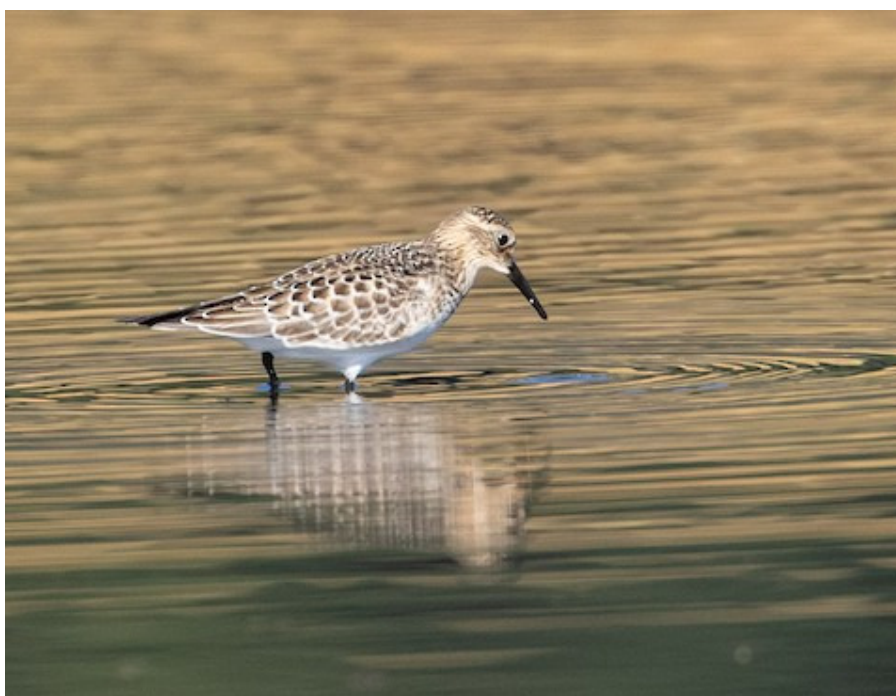
One of three juvenile Baird's Sandpipers at Lake Henshaw on 7 September 2019. Note the pale fringes on all the feathers of the upper parts, giving the young of this species the diagnostic scaly appearance.

The only White-winged Dove reported on the coast this month was one at Famosa Slough on 8 Sep (SH)—far fewer than expected. An adult male Broad-tailed Hummingbird at a private residence in Chula Vista on 17 Sep (EH) was probably the same bird present last winter.