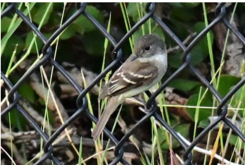
The Least Flycatcher present at Ft. Rosecrans National Cemetery since 28 September 2019. This photo from 30 September shows the short primary projection, the whitish wing bars and whitish edges on the secondaries and tertials on otherwise blackish wings, and the whitish under parts. Reported to be giving a sharp "whit" call rather than the "peek" call given by Hammond's Flycatchers.

A Least Flycatcher was in Ft. Rosecrans National Cemetery 28-30 Sep+ (GNu, eBird ). At least