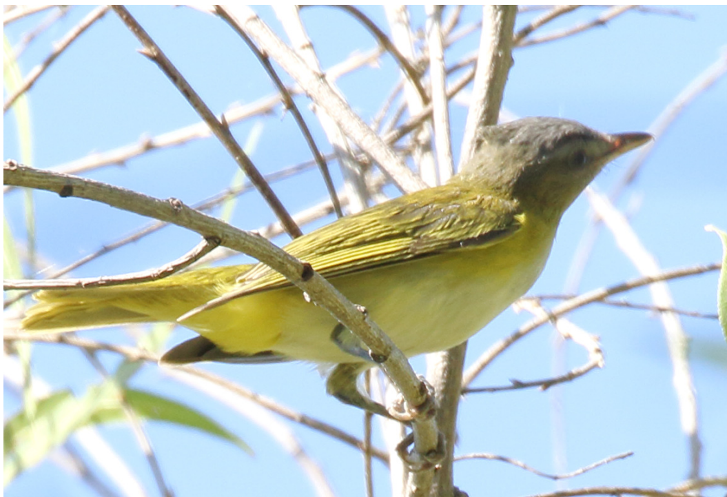
This Yellow-green Vireo, photographed on the second day of its 12-13 September 2019 stay at Lake O'Neill on Camp Pendleton, was one of three found in San Diego County in September. Note that the yellow on the sides of the breast extends upward onto the cheeks, the facial pattern is less prominent than that on the similar Red-eyed Vireo, and the upper parts are yellow-green vs olive-green as on a Red-eyed Vireo.

Red-breasted Nuthatches first appeared in the coastal lowlands around the first of September and were being reported from the Orange County line south to the Tijuana River Valley by the end of the month, documenting a major movement of this species into the coastal lowlands of Southern California. Up to 13 Red Crossbills have been frequenting the area at the upper end of Agua Dulce Creek in the Laguna Mts. since 18 Aug (MT), and two were still present there on 22 Sep ( eBird ). Clay-colored Sparrows have been scarcer than expected with only four reported, including single birds at North Island on 3 Sep (BF), at Ft. Rosecrans National Cemetery on 23 Sep (TJ), at a private residence in Coronado on 26 Sep (EC) and at Wing Street Canyon in Loma Portal on 27 Sep (MH). An adult male Baltimore Oriole was near the east end of Lake Hodges on 2 Sep (PJ). A Scott's Oriole at Ft. Rosecrans National