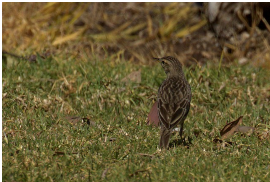
This photo of the Red-throated Pipit at Berry Park in Nestor, San Diego County on 18 February 2018 well shows the diagnostic boldly striped upper-parts.