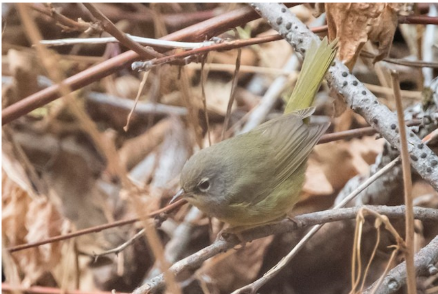
The hardy MacGillivray's Warbler at Doane Pond on Palomar Mountain, San Diego County, photographed on 18 February 2018.

Sparrow along the McCoy Trail at the Tijuana Slough National Wildlife Refuge in Imperial Beach on 3 Feb (NC), believed to be one of the three seen there in December, had been forced from the saltmarsh vegetation by the super high tides and is likely still present. Three of the six White-throated Sparrows known locally are frequenting feeders at private residences, with one each in Leucadia (KA), the area of Tecolote Canyon in San Diego (MM) and near Ramona (NC) remaining through February; in addition one was in Dos Picos Park near Ramona 3 Dec-28 Feb (JS, eBird ), another at a residence in Carmel Valley 1 Feb (DT) and the sixth in a residential area of Coronado 4-28 Feb+ (PEL, EC).