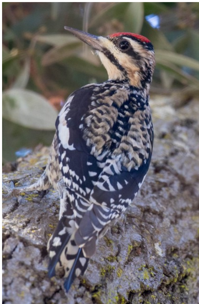
This photo of a sapsucker on El Secreto in Rancho Santa Fe, San Diego County on 4 February 2018 shows that the entirely white chin and throat are framed by unbroken black sub-malar stripes, and that golden-buffy markings are still present on the mantle, clearly showing it is a female Yellow-bellied Sapsucker.

ber Escondido Christmas Bird Count was still present 28 Feb+ (SP, eBird ). Two Swainson’s Hawks over east El Cajon on 2 Feb (CKS) and one with Turkey Vultures at the San Diego Safari Park near Escondido on 7 Feb were the earliest this spring, followed by a