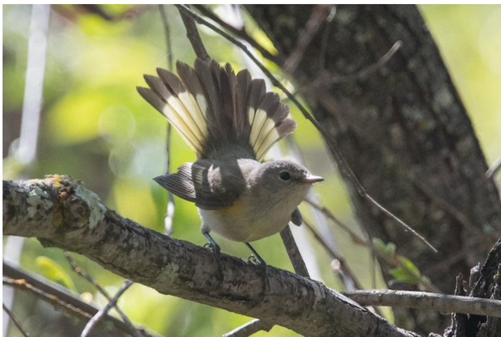
This female American Redstart photographed at Dos Picos County Park, San Diego County on 26 February 2018 was well showing its yellow and blackish tail pattern.

Four Black-and-white Warblers included long-staying birds at Nestor Park 23 Sep-28 Feb+ (GDeL,