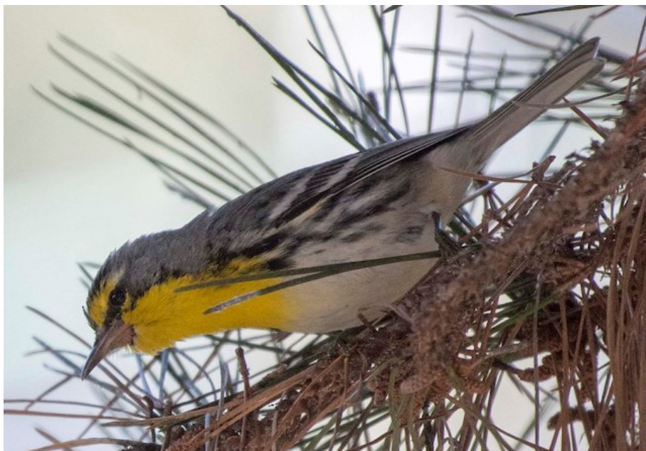
This photo of the Grace's Warbler at Crest Canyon in Del Mar, San Diego County taken on 11 February 2018 shows the short broad yellow supercilium and lack of the bold black facial markings that differentiate it from the somewhat similar Yellow-throated Warbler.

February, including single birds at the western edge of Balboa Park near the intersection of 6 th Ave. and El Prado 4 Dec-23 Feb (TRS, eBird ), in Nestor Park in Nestor 9 Dec-28 Feb+ (GMcC, eBird ), at Spreckles Park in Coronado 14 Dec-4 Feb (PEL), at the Old Trolley Barn Park in Mission Hills 2 Jan-26 Feb (PEL), along West Shepherd Canyon in Tierrasanta 6-25 Feb (NC, eBird ) and at De Anza Cove at the north end of Mission Bay on 11 Feb (PEL). An adult male Rose-breasted Grosbeak was along West Shepherd Canyon in Tierrasanta 26 Jan-14 Feb (PEL, eBird ),