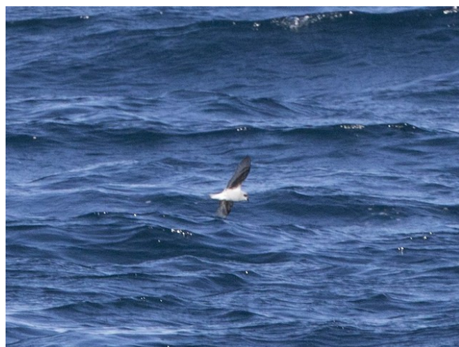
These two photos taken of the Fork-tailed Storm-Petrel off San Diego, San Diego County on 25 February 2018 not only show the pale gray coloration of the bird, but also the diagnostic blackish on the lesser coverts on the upper side of the wings, and the dark underwing coverts.