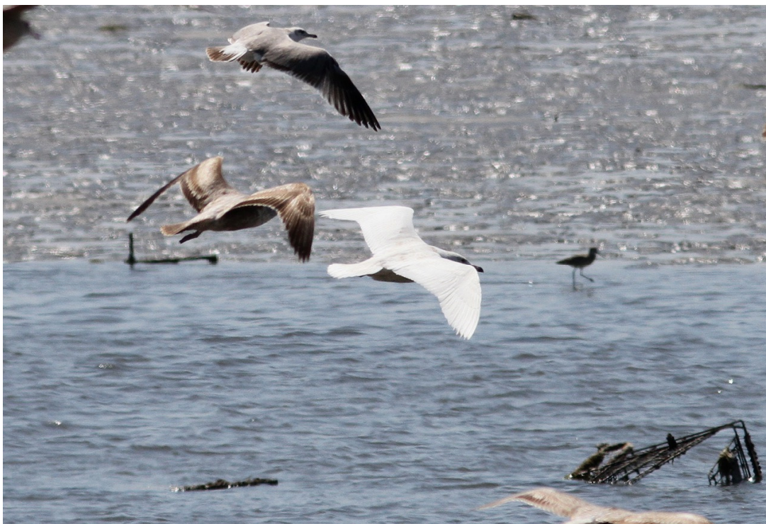
This short-staying first-winter Glaucous Gull was at Marina View Park in Chula Vista during part of the afternoon on 3 April 2016. The characteristic black tipped pale pink bill is mostly hidden in this photo.

A Black-footed Albatross, rare in San Diego County waters, was 19 miles west of La Jolla on 30 Apr (PEL). Two Manx Shearwaters were identified from