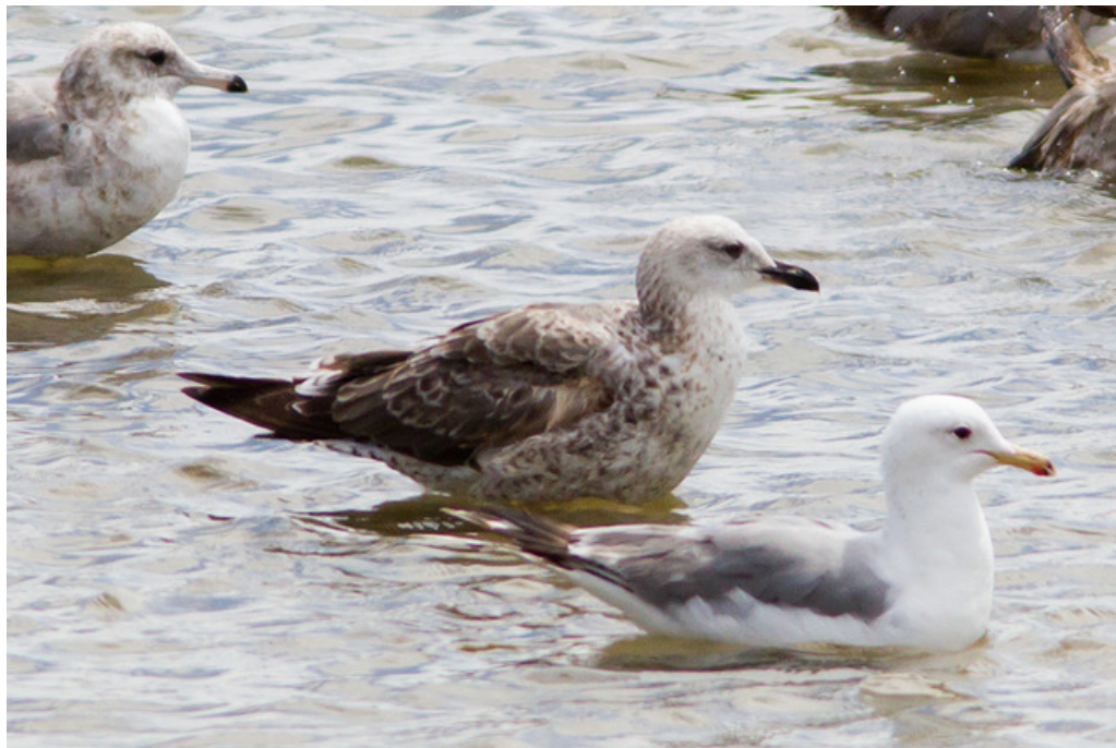
This immature Lesser Black-backed Gull, photographed on 22 April 2016, was present at the mouth of Los Penasquitos Lagoon 19 to 25 April. Note the somewhat dark coloration on the mantle, the mostly pale head with dark markings around the eye, the somewhat slender all black bill, and the long wings, all typically seen on first-winter birds.

Borrego Springs 11-19 Apr (HC, RT), and another was photographed in Ramona on 25 Apr (NC). Single immature Zone-tailed Hawks were in Fallbrook on 10 Apr (KW) and at Torrey Pines on 15 Apr (MaL). Single Solitary Sandpipers, rare as spring migrants in San Diego County, were at Borrego Springs 9-10 Apr (AM, NC), at Famosa Slough in Ocean Beach on 16 Apr (GN), and at San Elijo Lagoon 16-19 Apr (SB, MN).