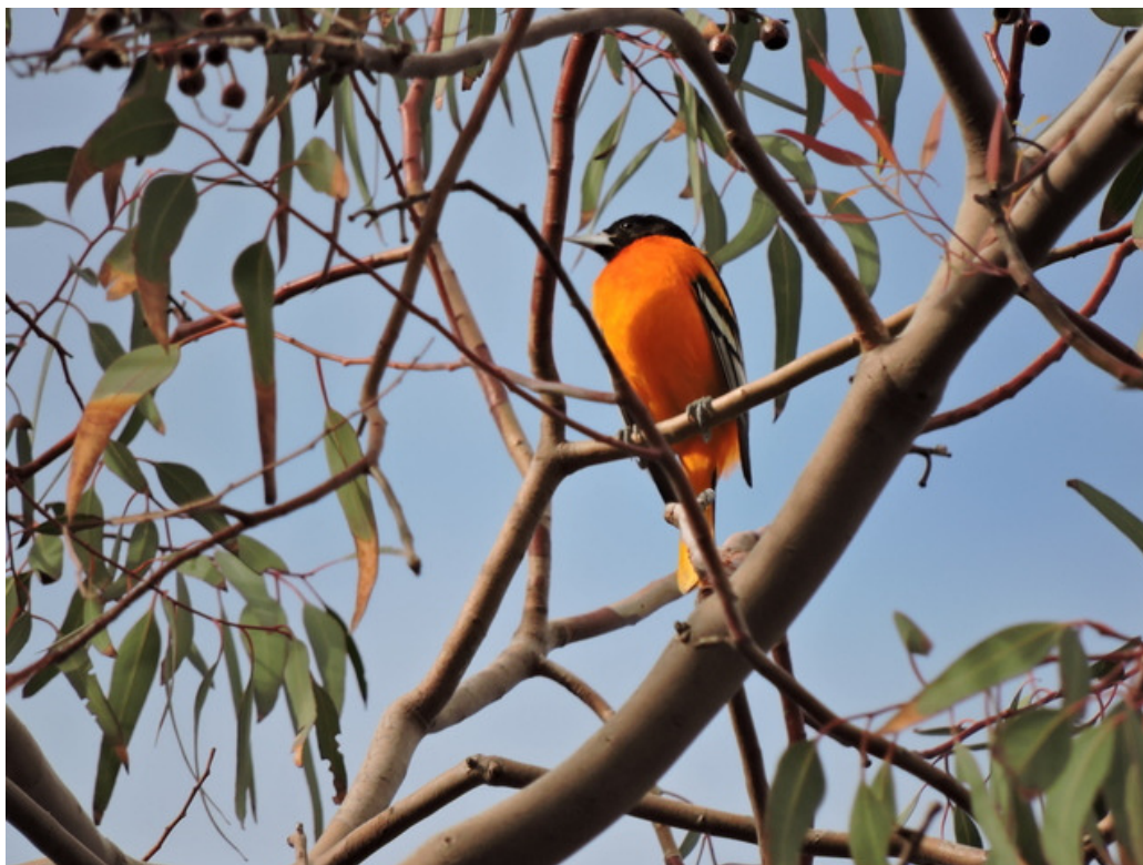
This brightly colored adult male Baltimore Oriole was photographed at De Anza Cove on Mission Bay on 10 April 2016.

wintered locally. An adult male Baltimore Oriole at De Anza Cove on Mission Bay on 10 Apr (JB) may have been an early spring vagrant. Up to at least 10 Cassin's Finches remaining around Cottonwood Campground in the McCain Valley through at least 8 Apr (DG) were well away from the closest known breeding areas in the San Jacinto Mountains of Riverside County. Three Red Crossbills at the Del Mar Hills School in Del Mar on 11 Apr (AJS) and one in Jacumba on 16 Apr (EGK) were most likely associated with the major movement of Red Cross-