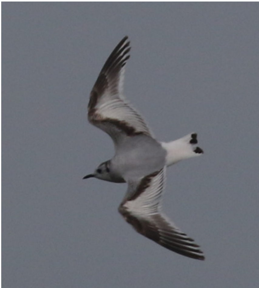
San Diego County's third Little Gull, showing the prominent "W" wing-pattern expected on first-winter birds, was present at the mouth of Los Peñasquitos Lagoon on and off throughout most of 7 April 2016.

yellow tinged orange, a short stripe of orange along the upper mandible, and a small patch of orange at the base of the bill, suggesting the bird was either a hybrid Sandwich x Elegant Tern or an Elegant Tern with an extreme amount of black on the bill.