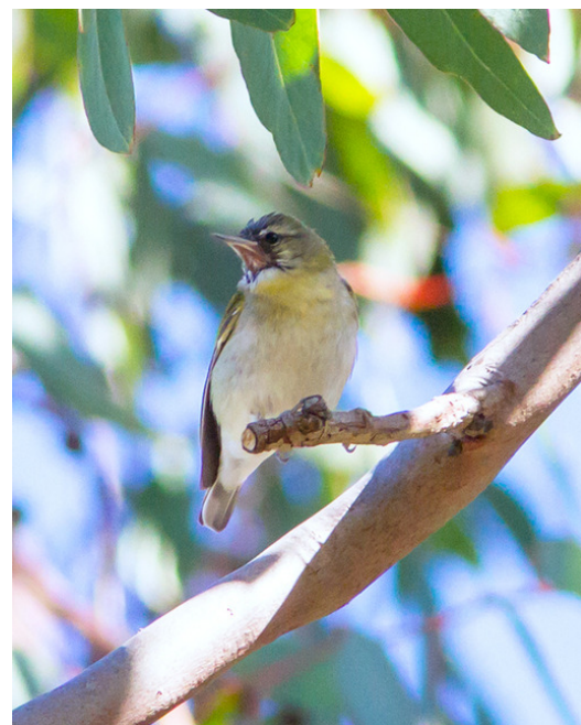
Note the black on the face of this Tennessee Warbler at UCSD in La Jolla on 26 January 2016. This is a mixture of dirt and nectar from eucalyptus blossoms, obtained when feeding at the blossoms over an extended period of time.

Noteworthy wood-warblers include a Tennessee Warbler feeding in flowering eucalyptus near the Faculty Club at UCSD in La Jolla 22-31 Jan (DH, ML). Palm Warblers are much scarcer than expected throughout Southern California this winter. One found near Pantoja Park in downtown San Diego on 16 Dec (SC) and still present on 30 Jan (BC) and another at San Dieguito Lagoon in Del Mar on 28 Jan (BS) are the only two known in the County this month. The Northern Waterthrush on the north side