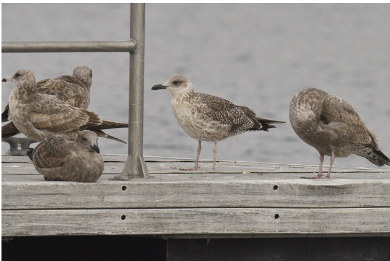
This Lesser Black-backed Gull at Lower Otay Lake on 18 January 2016 shows the somewhat dark coloration on the mantle, a mostly pale head with dark markings around the eye, and the somewhat slender all black bill typically seen on first-winter birds.

were two off San Diego on 22 Jan (M & PT) and 16 there five days later (DP). Following the minor influx of Black-legged Kittiwakes in late November, the only ones reported this month were single birds at Pt. La Jolla in La Jolla on 8 Jan (JB), 10 Jan (GN) and 30 Jan (JP). The adult Laughing Gull found at Bayside Park in Chula Vista on 17 Nov (JMcM) was present