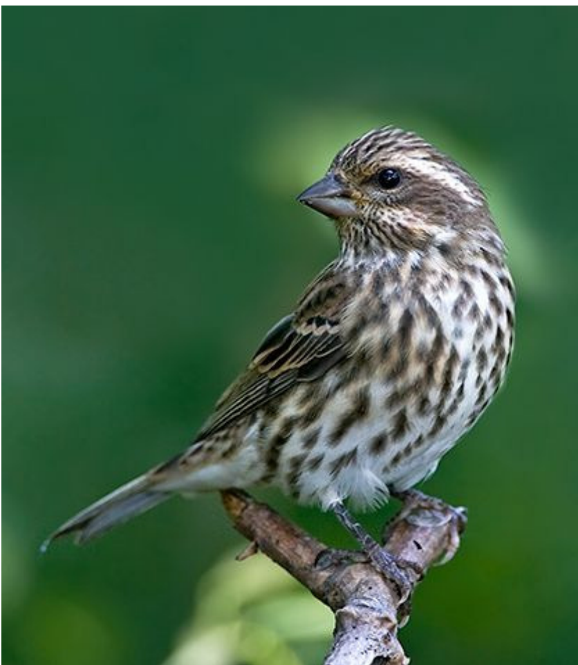
This Purple Finch at the Bird & Butterfly Garden in the Tijuana River Valley on 1 January 2016 was one of a small number scattered throughout the coastal lowlands this winter.

of San Elijo Lagoon continues 12 Nov–30 Jan (PAG, RA). A Hermit Warbler was frequenting a Monterey Pine on Rimini Rd. in Del Mar 11 Jan–3 Feb (PEL, SES). Two Black-throated Green Warblers continued, one at Greenwood Cemetery in San Diego 16 Oct–9 Jan (MSa, RA) and one in Friendship Park in Chula Vista 1 Nov–20 Jan (PEL). The Painted Redstart found in West Shepherd Canyon in Tierrasanta 28