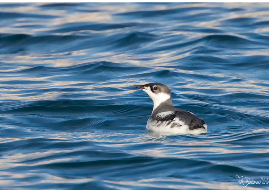
Unexpected was this basic-plumage Marbled Murrelet in the sport fishing boat basin at the north end of San Diego Bay on 1 January 2016. The similar looking but unrecorded in Southern California Long-billed Murrelet has more black on the head, with a head pattern resembling that of a Scripps's Murrelet.

In addition to the three Zone-tailed Hawks noted in the Escondido CBC report, a first-winter bird was soaring over Rancho Bernardo on 9 Jan (JJ), an adult was at Lake Wohlford on 16 Jan (JR) and another adult was farther inland near Santa Ysabel on 26 Jan (AM), documenting the presence of at least six wintering in the County. Two returning wintering Pacific Golden-Plovers continue, one at the Tijuana River mouth 27 Aug–20 Jan (RTP, MSa) and one at the mouth of the San Dieguito Lagoon in Del Mar 9 Sep–25 Jan (SB, BM).