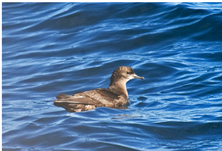
This Short-tailed Shearwater at the 9-Mile Bank on 1 January 2016 was one of only two seen over San Diego County waters this month – note the rounded head, relatively short bill, and pale chin that can be used in part to separate this species from the very similar Sooty Shearwater.

A female Eurasian Wigeon continues for its second winter in the desert, where very rare, near the Roadrunner Club in Borrego Springs 20 Dec–3 Feb (PEL, RT). A female Black Scoter was seen off Grand Caribe Cswy. at Coronado Cays 14 Jan (PEL), and the Red-necked Grebe found in the Oceanside Harbor on 30 Dec (PAG) was still present on 28 Jan (DM). Northern Fulmars were more numerous than expected off the coast as indicated by such numbers as 100+ off