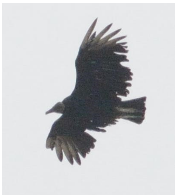
Black Vulture in Jacumba.

Five Black Oystercatchers at the tide pools on Pt. Loma 15 Aug (GJ) were the first to be reported locally in nearly two months. Two juvenile Solitary Sandpipers at the Dairy Mart Ponds in the Tijuana River Valley 30-31 Aug (NC, GMcC) were the earliest of the fall migrants this year. Baird's Sandpipers were generally late arriving in Southern California this fall; however, five had been found in this County by the month's end, with single juveniles at the Santa Margareta River mouth on 2 Aug (JB) and 18 Aug (JMCM), a juvenile photographed on the salt ponds at south San Diego Bay on 22 Aug (RTP) and two juveniles together at the Tijuana River mouth on 28 Aug (MS). The three Semipalmated Sandpipers known present were all ju-