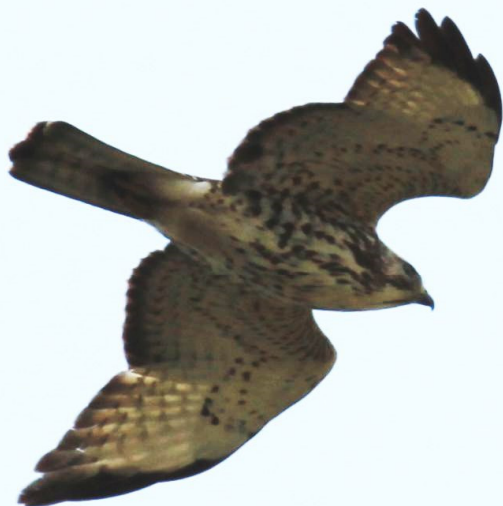
Broad-winged Hawk in the Tijuana River Valley.