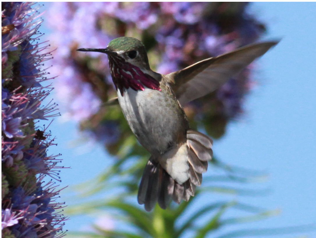
Calliope Hummingbird at Pt. Loma.