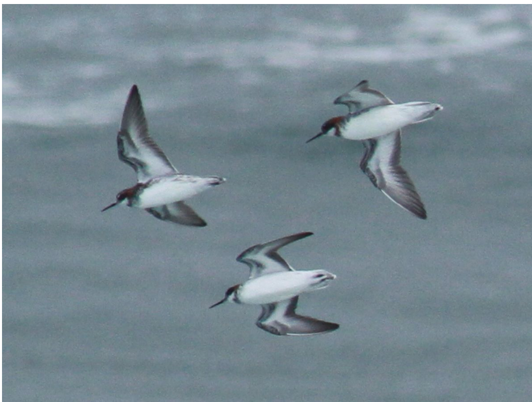
Red-necked Phalaropes at Pt. La Jolla.

The first migrant Gray Flycatcher this spring was at Ft. Rosecrans National Cemetery 19 Apr (GN). A Dusky Flycatcher, rare on the coast, was in the cemetery 20 Apr (GN). Only one of the two wintering