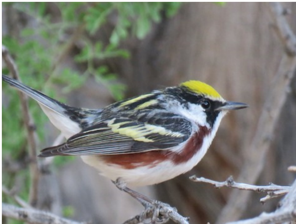
This showy male Chestnut-sided Warbler was at De Anza Country Club in Borrego Springs on 10 May 2019.

SanDiegoRegionBirding@groups.io. Observers reporting additional sightings to eBird are not listed but acknowledged.