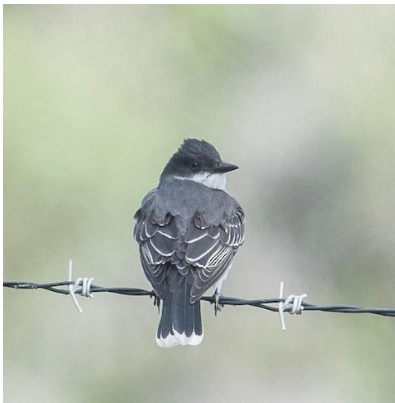
The Eastern Kingbird at Ft. Rosecrans National Cemetery associated with migrating Western Kingbirds on the exceptionally early dates of 4-10 May 2019.