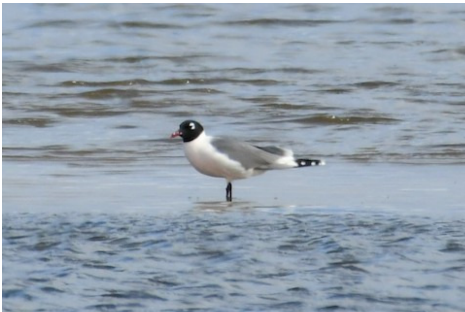
The adult Franklin's Gull at the South San Diego Bay National Wildlife Refuge on 20 May 2019. The prominent white eye-arcs and large white tips on the primaries help to separate it from the similar but larger Laughing Gull.

The Nelson's Sparrow found at San Elijo Lagoon on 30 Apr (BM) remained through 7 May (JMcM). As pointed out a month ago, wintering Nelson's Sparrows are known to stay into March, possibly later (California Bird Records Committee, 2007), and vagrants have been recorded through May, including one photographed at Mariner's Point in Mission Bay on 20 May 2007 ( North American Birds 61:514). The Harris's Sparrow at a private residence in Sabre Springs since November was last seen on 2 May (LR). The latest of the wintering White-crowned Sparrows were single birds at a residence in San Diego and at Lake Hodges on 26 May (DR and KH), and the latest Golden-crowned Sparrow was one at Ft. Rosecrans National Cemetery 4-7 May (GN, eBird ). Both White-crowned and Golden-crowned Sparrows have been recorded into June (Unitt 2004). An adult male Baltimore Oriole in Jacumba on 24 May (PEL) was an obvious spring vagrant.