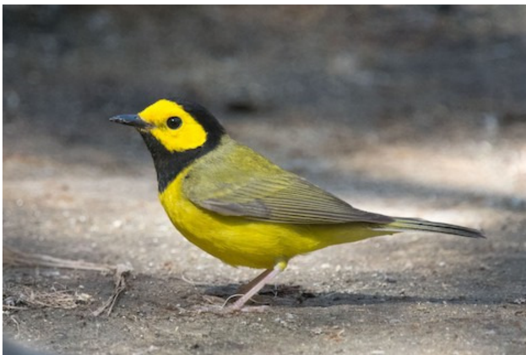
This unmistakable male Hooded Warbler at Agua Caliente County Park on 6 May 2019 was one of two found in San Diego County this month.

Listed observers: Observers listed are limited to those finding, identifying and/or last reporting each species, these mostly reported on our local listserv