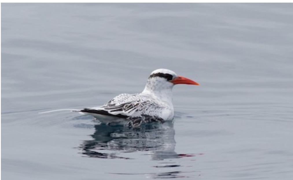
This adult Red-billed Tropicbird was only five miles off San Diego on 3 May 2019.

Only two Black-and-white Warblers were reported, with single birds at Ft. Rosecrans National Cemetery on 4 May (PR) and on 15 May (NF). A singing Hooded Warbler was along Tecolote Canyon in Bay Park on 3 May (KR), and a most cooperative male was at Agua Caliente County Park in Anza-Borrego Desert State Park on 6 May (NC). Different American Redstarts visited dripping water at a private residence in Vallecito along the eastern edge of San Diego County on 4, 15 and 16 May (BLS), and single birds were along the coast at the San Diego Botanic Garden in Encinitas on 6 May (SES) and in residential Pt. Loma 25-27 May (AA, eBird ). Three Northern Parulas were reported, with single birds at Florida Canyon in Balboa Park on 14 May (NF), at Point Loma Nazarene University on 23 May (PEL) and at the extreme western end of Otay Valley Regional Park on 25 May (CGE). A Chestnut-sided Warbler at the De Anza Country Club in Borrego Springs on 10 May