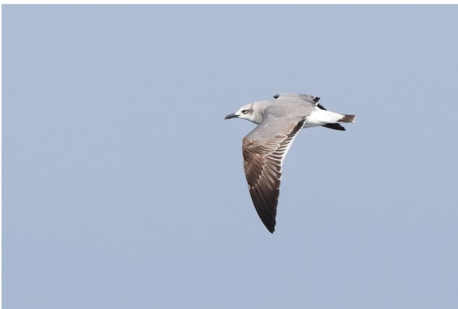
The first-winter Laughing Gull over the open ocean a short distance off Sunset Cliffs in Point Loma on 1 January 2018.

What may have been the Pacific Golden-plover at the Tijuana River mouth 21 Aug-27 Nov was photographed with roosting Black-bellied Plovers near the southwest corner of the South San Diego Bay National Wildlife Refuge on 3 Jan (PM). The Mountain Plover found on Mission Bay's Fiesta Island on 14 Nov remained through 1 Jan (GN, eBird ). A first-winter Laughing Gull off Sunset Cliffs was the highlight of the annual 1 January boat trip off San Diego (DP). A first-winter Lesser Black-backed Gull was photographed at the San Diego River mouth on 17 Jan (JCS). Two of the four adult Nazca Boobies present in mid-December remained on south San Diego Bay through 31 Jan+ (PEL, eBird ). Also noteworthy was an adult female Brown