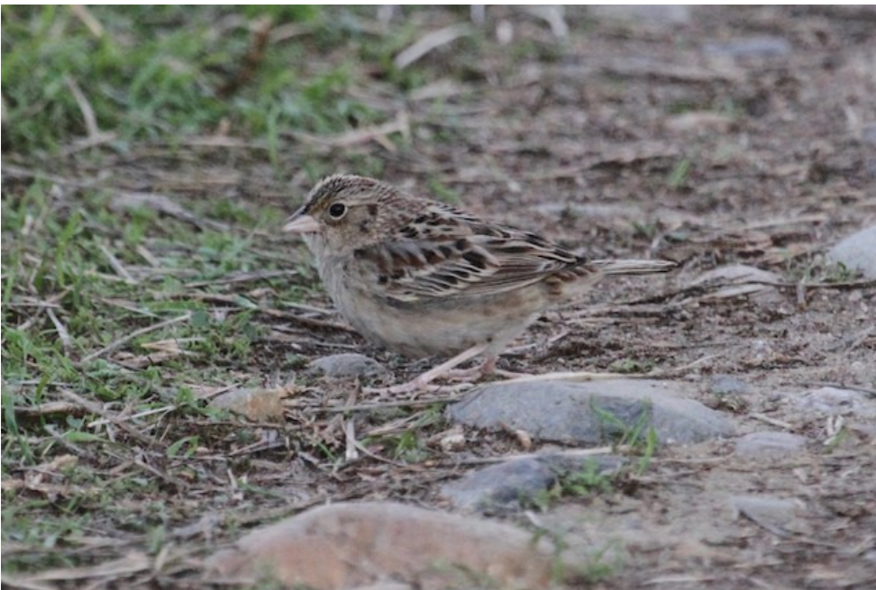
The Grasshopper Sparrow at Fiesta Island on Mission Bay in San Diego on 20 January 2018. Note the lack of markings on the underparts, the pale eye-ring on an otherwise somewhat blank looking face, and the whitish median crown stripe.

capped Flycatcher found near Berry Park in Nestor on 15 Dec was last reported 12 Jan (PEL, eBird ) and probably still in that area. An Ash-throated Flycatcher, rare in winter, was at Montclair Park 24-27 Jan (MSt,