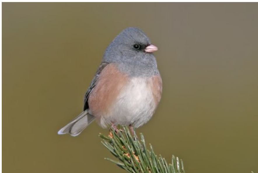
OK, what is it?