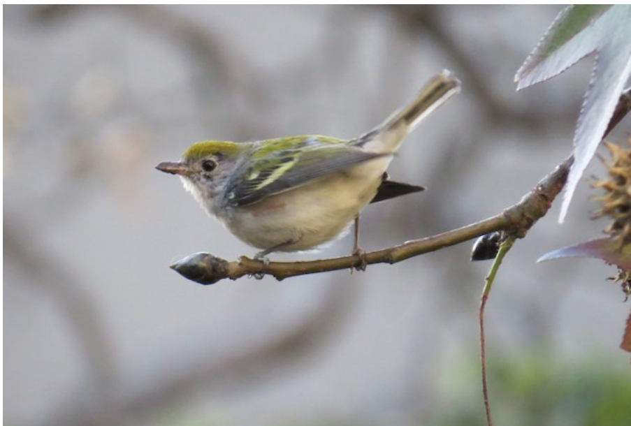
The Chestnut-sided Warbler at Pantoja Park in downtown San Diego on 3 February 2018. Note that "soiling" distorts the true shape of the bill, and that the lack of obvious chestnut on the sides suggests it is a female.

cally is one with Chipping Sparrows at San Diego's Hollywood Park 16 Dec-20 Jan (RA, eBird ). A Grasshopper Sparrow, not often detected in winter, was well photographed at the unexpected location of Fiesta Island on Mission Bay 20