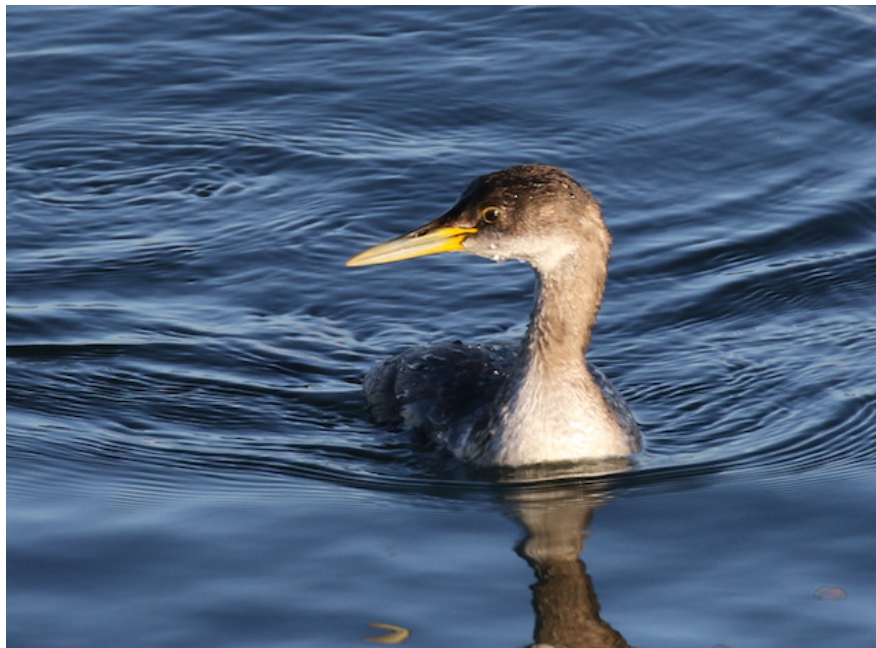
The adult Red-necked Grebe on San Diego Bay at the Shelter Island Fishing Pier on 26 January 2018.

At least four Eurasian Wigeons were present, with single males at the San Diego River mouth 30 Sep-31 Jan+ (JB, eBird ), on San Elijo Lagoon 29 Nov-14 Jan (JMcM, eBird ), along the lower Sweetwater River in Chula Vista/National City 16 Dec-23 Jan (DJ, eBird ) and along Highland Valley Rd. near Ramona on 15 Jan (BP). Up to two adult male Black Scoters remained off Grand Caribe Shoreline Park on south San Diego Bay from 11 Dec through 28 Jan (BLC, eBird ). The female Long-tailed Duck found along the lower Otay River in Imperial Beach on 9 Dec moved into the adjacent South San Diego Bay National Wildlife Refuge where still present on 23 Jan (DB, RTP). A Red-necked Grebe, rare as far south as San Diego, remained around Shelter Island on San Diego Bay 19-31 Jan+ (SJ, eBird ).