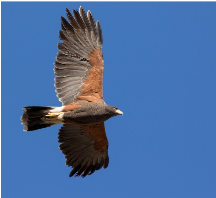
The adult Harris's Hawk in flight along Montecito Way near the Ramona Airport on 2 January 2018.

Booby present on south San Diego Bay 1-30 Jan ( eBird ). The immature Tricolored Heron found on south San Diego Bay on 1 Oct was last reported on 11 Jan (BF, eBird ) but could easily be overlooked if it is frequenting closed areas along the south shore of the bay or in the South San Diego Bay National Wildlife Refuge, and the other, found at the mouth of the San Diego River on 13 Oct, was still present 31 Jan+ (LR, eBird ).