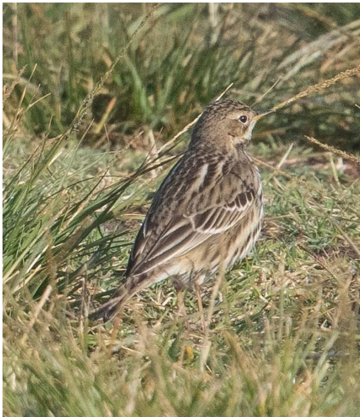
The wintering Red-throated Pipit at Berry Park on 19 December 2017. Note the prominent streaking on the crown and mantle, and the fact that the legs are pale pink.

capped Flycatcher found near Berry Park in Nestor on 15 Dec was last reported 12 Jan (PEL, eBird ) and probably still in that area. An Ash-throated Flycatcher, rare in winter, was at Montclair Park 24-27 Jan (MSt,