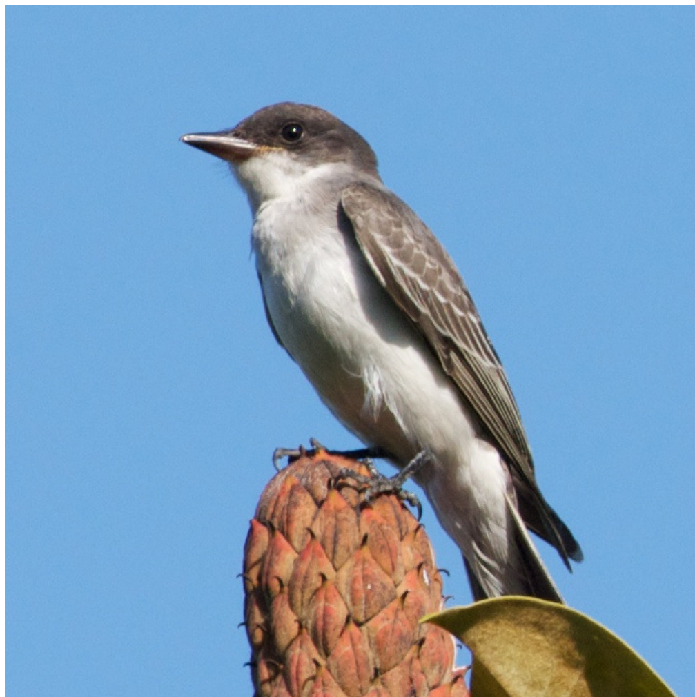
Eastern Kingbird at Presidio Park, 22 Sep 14.

Mission Valley 11 Sep (JMCM), and up to three at the main Dairy Mart Pond 18-30 Sep (MSa, GMcC). Single Black-and-white Warblers appeared in six places: Lake Murray 16 Sep (JRM), Silvergate Ave. & Dupont St. in Pt. Loma 16 Sep (SES), the San Diego