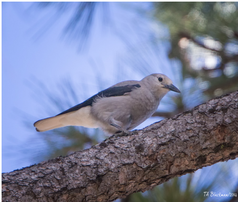
Clark's Nutcracker at Laguna Meadow, Laguna Mountains.

(MD) has not been reported since 1 Feb (GG). A Black Oystercatcher, virtually unrecorded locally this winter, was at Pt. La Jolla 9 Feb (SW) and another was on the Zuniga Jetty at the entrance to San Diego Bay 15 Feb (DP). The first-winter Glaucous Gull found at the San Luis Rey River mouth in Oceanside 17 Dec (KW) was still present at the end of this month (SB), and remarkably a second-winter bird photographed in flight at the San Diego River mouth 12 Feb (TAB) had been seen at south San Diego Bay earlier that day (MSa). The Inca Dove found at the Roadrunner