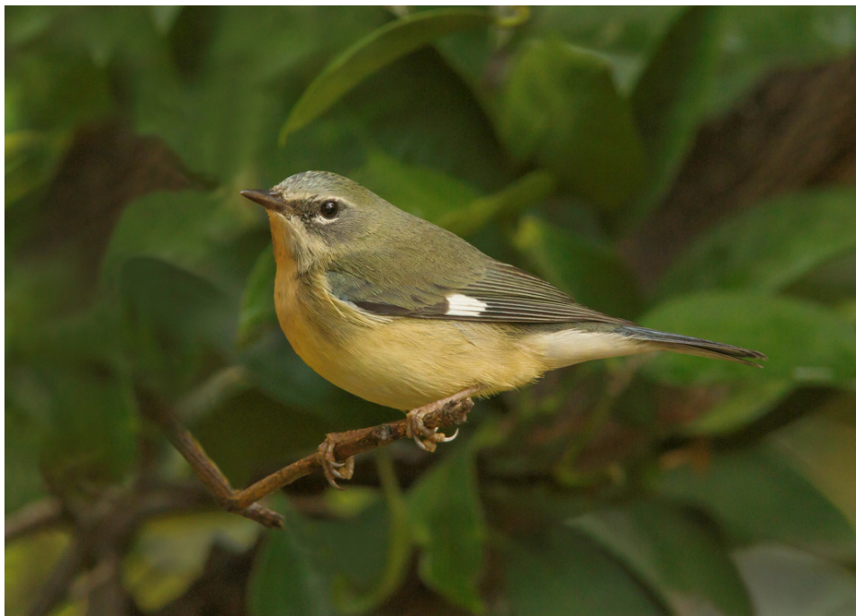
Black-throated Blue Warbler in San Carlos.

month, with single birds at the west side of Balboa Park 8-10 Nov (PEL), in Coronado 11 Nov (PEL), in San Diego's Greenwood Cemetery 12-21 Nov (JZ) and in the residential area on the east side of Pt. Loma 20 Nov (BLC). A female Orchard Oriole was frequenting ornamental plantings at the west side of Mission Bay 12-15 Nov (MSa), and an adult male was seen in a residential area of Encinitas 25 Nov (DB). Unlike in recent winters when multiple Baltimore Orioles were known present, a female frequenting ornamental plantings at the west side of Mission Bay 12-15 Nov (PEL) was the only one reported.