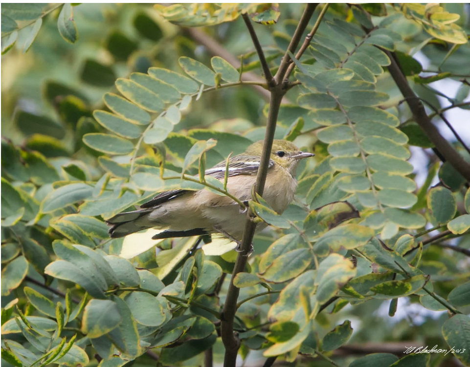
Bay-breasted Warbler in University City.

through 24 Nov (PEL), single birds were on the playing field at Mar Vista School in Imperial Beach on 6 Nov (PEL) and at the AG Sod Farm in the Tijuana River Valley on 17 Nov (JB), and two were seen with Horned Larks at Ream Field in Imperial Beach on 19 Nov (PEL).