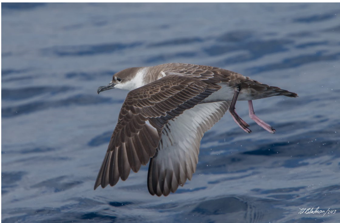
Great Shearwater at the 9-Mile Bank.

October is the month that wintering geese arrive in San Diego County. Up to six Greater White-fronted Geese near Del Mar at the Fairbanks Ranch horse pas-